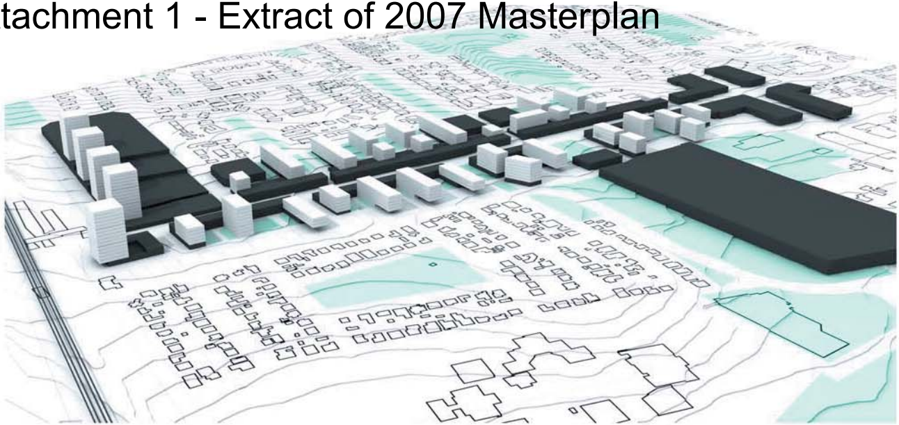
a. Aerial View - looking from North West