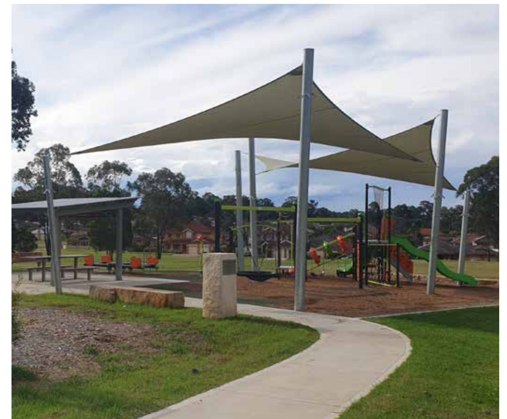
SHADE SAIL STRUCTURE

NOTE: INDICATIVE IMAGES SHOWING POTENTIAL ELEMENTS FOR TRINITY DRIVE JUNIOR PLAY SPACE