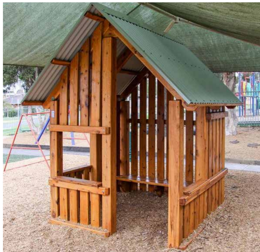
PLAY CUBBY WITH SHOP FRONT