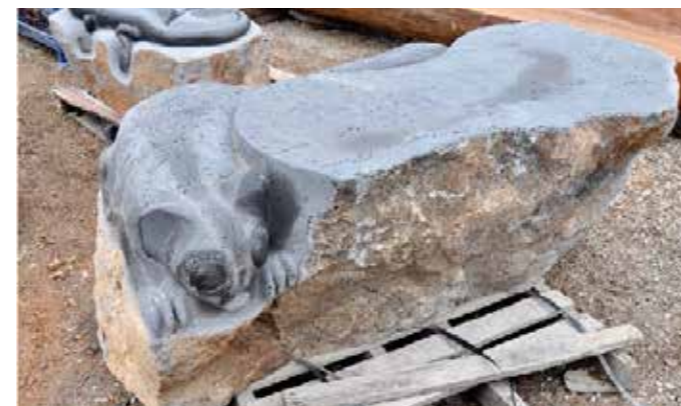
CARVED FEATURE ROCK