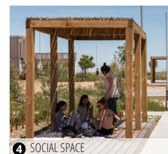
4 SOCIAL SPACE