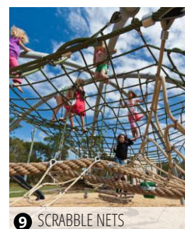
9 SCRABBLE NETS