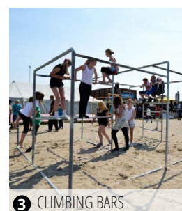
3 CLIMBING BARS