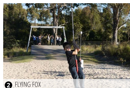
2 FLYING FOX