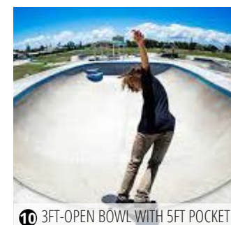
10 3FT-OPEN BOWL WITH 5FT POCKET