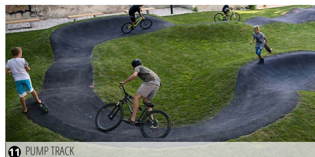
11 PUMP TRACK