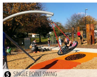
5 SINGLE POINT SWING