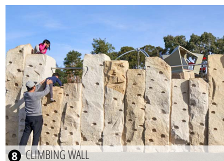
8 CLIMBING WALL