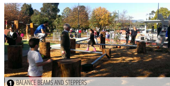
1 BALANCE BEAMS AND STEPPERS

Overall, while aimed at youth, the space that is suitable for all ages and respectful of its natural environment.