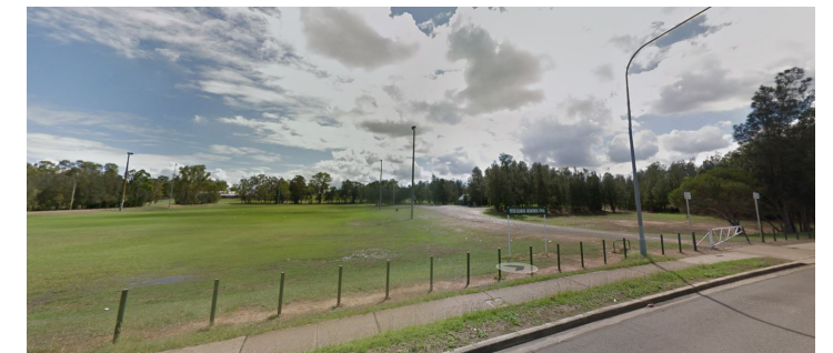
4. POTENTIAL FUTURE PATH ACCESS FROM PETER KEARNS MEMORIAL OVAL CARPARK