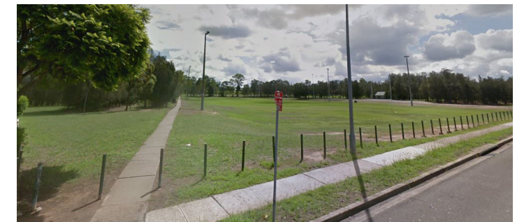
3. EXISTING PATH ACCESS FROM SOLANDER DRIVE WITH POTENTIAL FOR CONNECTING LINK TO PLAYGROUND