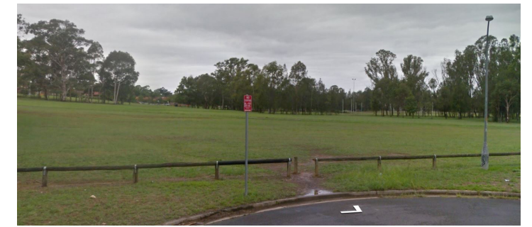
2. POTENTIAL FUTURE PATH ACCESS FROM FINCH PLACE