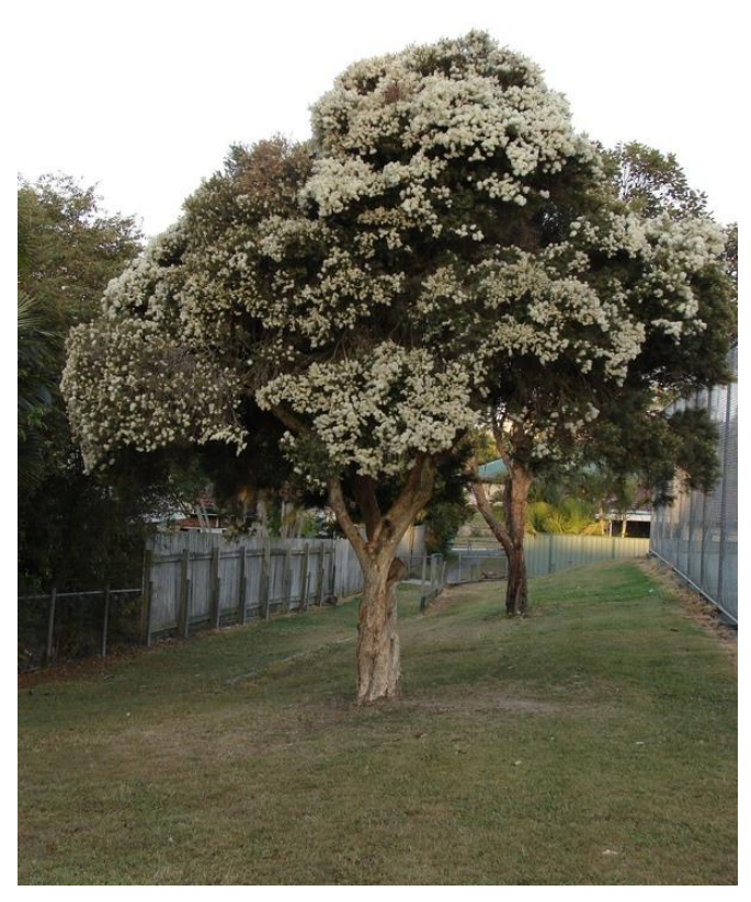
8m at full maturity, with a canopy of 4-8m wide.

This small native evergreen species features a soft papery bark and small dark green leaves. Flower spikes bloom in early summer leaving attractive masses of snowy white fragrant blossoms. Given the nature of the soil and local environment, we expect this tree to reach up to