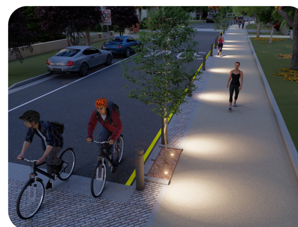
NEPEAN AVENUE AT DUSK